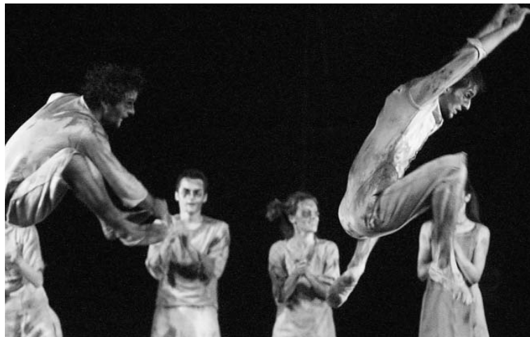
▶▶ Ballet Evening